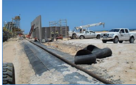
Shark Bay Salt vaults