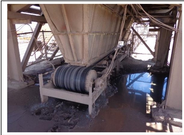
Exposed conveyor belts