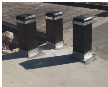
Marina bollard installation