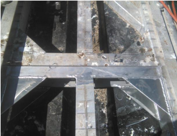
Repairs to aluminium pedestrian finger at Geraldton marina