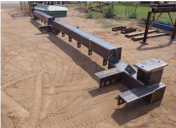
Jetty support steel for Port Gregory