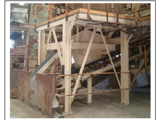
New crusher screen chute and steelwork - CSBP