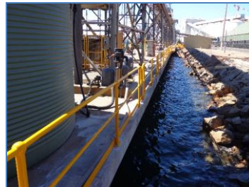
Geraldton Port berth 4 guard rail and handrail installation